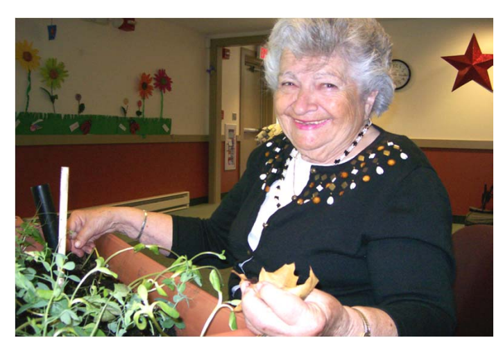
Garden Therapy— Members of the Hyannis Garden Club engage our clients monthly with the joys of nature

Intergenerational Programs Music Therapy Companion Animal Program Hyannis Garden Club Senior Center Events Entertainment