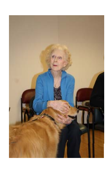
Companion Animal Program visits once a month for pet therapy